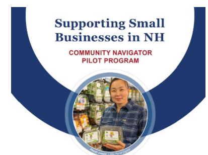
Community Navigator Program Statewide