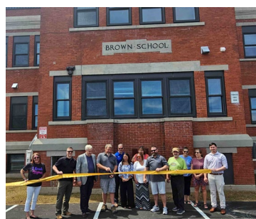
The Brown School Project Berlin