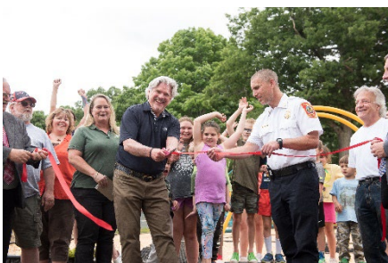
Community Center Investment Program Statewide